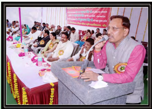
समारोह को सम्बोधित करते मुख्य विकास अधिकारी, बाँदा