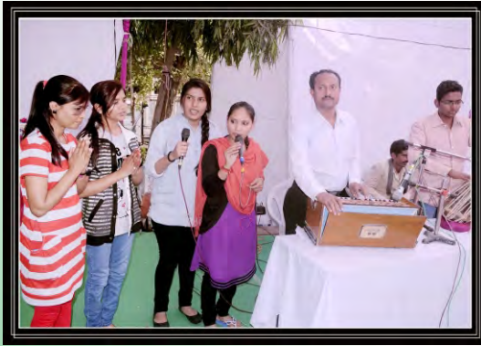
समारोह मंच पर स्वागतगीत प्रस्तुत करतीं महाविद्यालय की छात्रायें