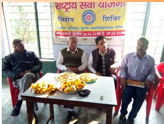
राष्ट्रीय सेवा योजना शिविर समापन समारोह में उपस्थिति महाविद्यालय के शिक्षक एवं अतिथि