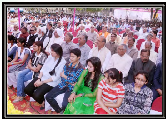
समारोह में उपस्थित महाविद्यालय के छात्र व छात्रायें