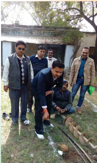
छात्रों को प्रायोगिक कार्य के लिए लेआउट देते महाविद्यालय के प्राचार्य एवं शिक्षक