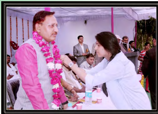
बाँदा सी.डी.ओ. का बैज अलंकरण करती महाविद्यालय की छात्रा