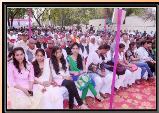
समारोह में उपस्थित महाविद्यालय के छात्र व छात्रायें